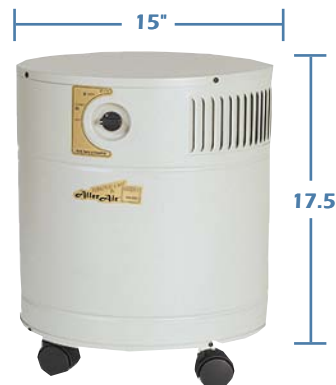
Shipping Weight: 38 lbs

More Filtration. More Features. Better Value. Guaranteed!