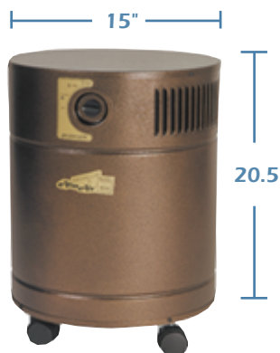
Shipping Weight: 50 lbs

Invest in the health of your family with the AllerAir 5000 Vocarb